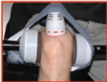
◀ Dual Ultrasound with Light Therapy - Knee