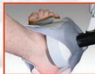
Ultrasound - Foot