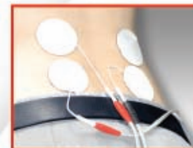
Interferential - Lower Back