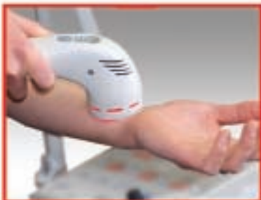
◀ Light Therapy - Carpal Tunnel