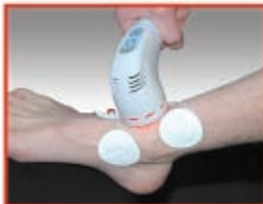
▶ Light Therapy with Interferential - Ankle