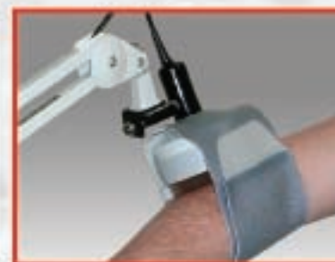
Ultrasound - Elbow

The HF54 delivers ultrasound through one or two 3 5/8" soundheads. Both soundheads, interferential/premod and light therapy can operate at the same time.