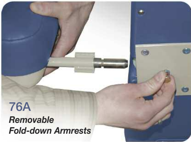
76A Removable Fold-down Armrests