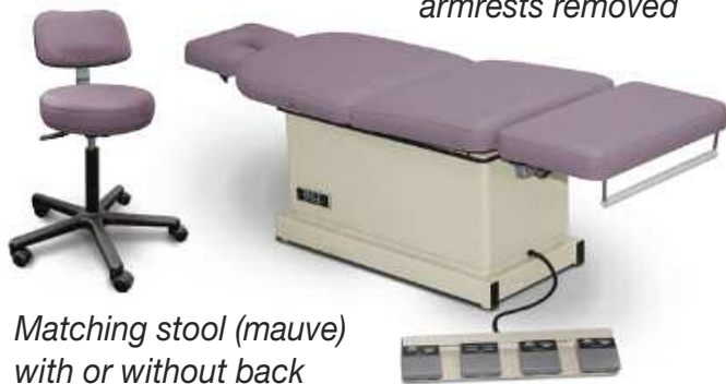
Matching stool (mauve) with or without back

Below: Fully reclined with armrests removed