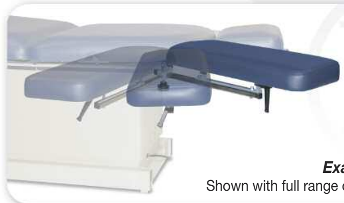
Examining Shown with full range of motion

Below: Fully reclined with armrests removed