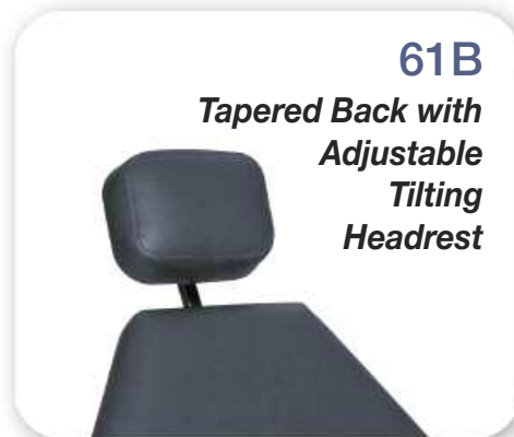
61B Tapered Back with Adjustable Tilting Headrest