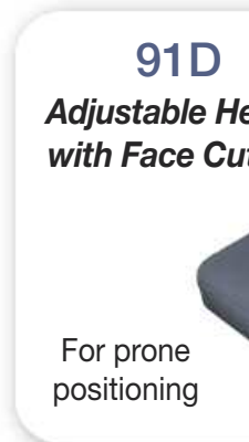
91D Adjustable Headrest with Face Cradle