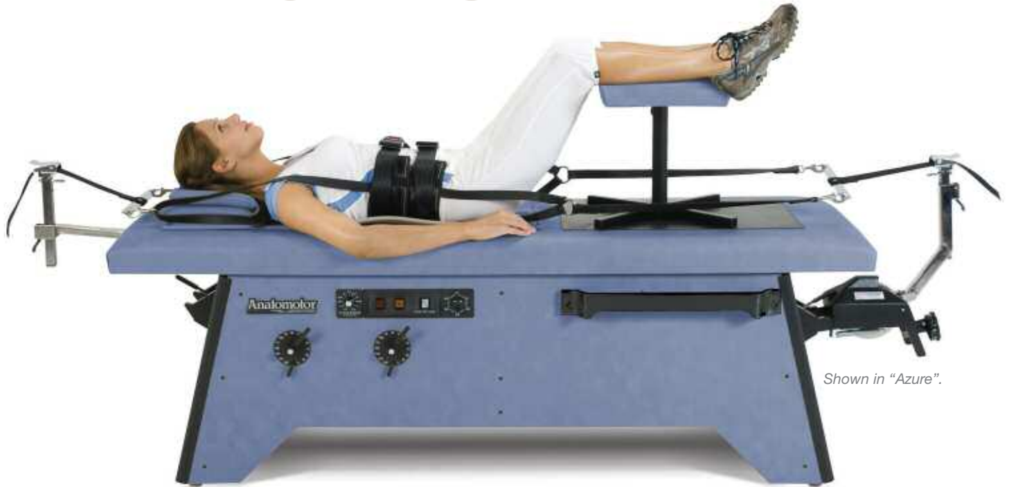
Shown in "Azure".