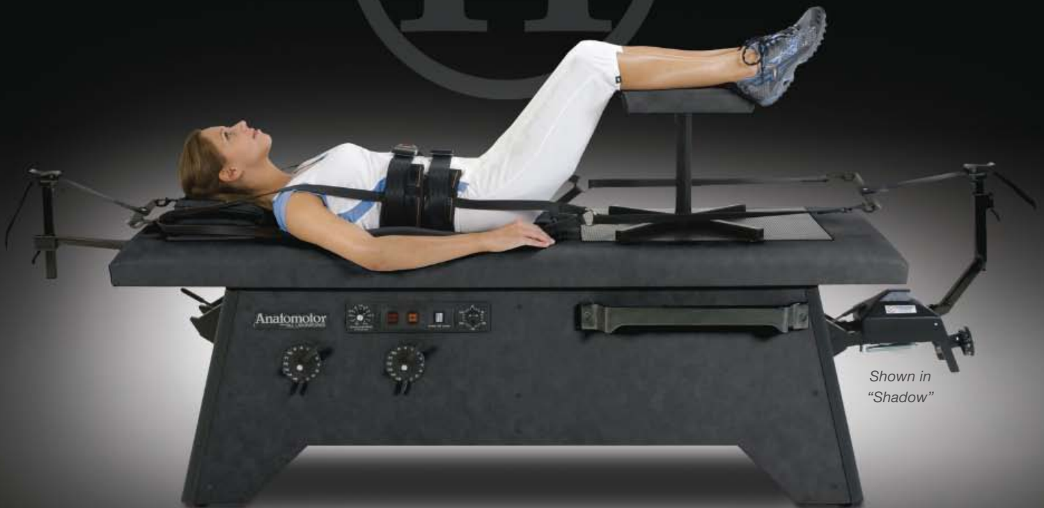
Shown in "Shadow"