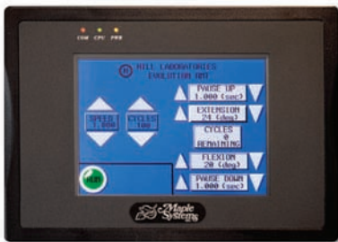
Evolution RMT™ touch-screen control panel.